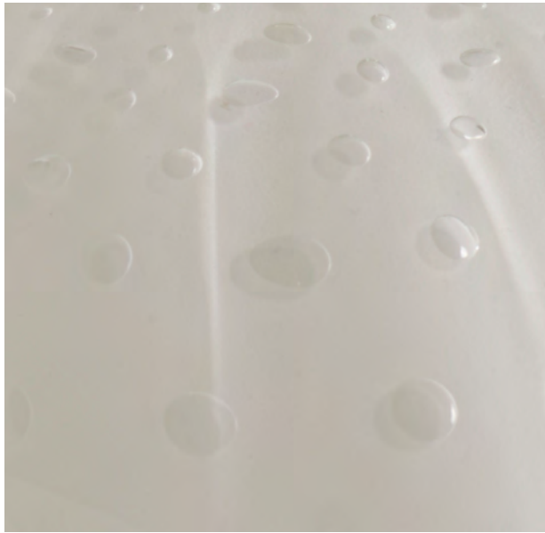
HAND BLOWN BULLICANTE GLASS

EVERY GLASS PIECE IS METICULOUSLY HANDMADE, UTILIZING TIME-HONORED METHODS. DUE TO THIS ARTISANAL APPROACH, MINOR DISTINCTIONS CAN BE ANTICIPATED, ADDING TO THE UNIQUENESS OF EACH PIECE, ENSURING IT IS TRULY ONE OF A KIND