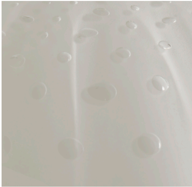
HAND BLOWN BULLICANTE GLASS

EVERY GLASS PIECE IS METICULOUSLY HANDMADE, UTILIZING TIME-HONORED METHODS. DUE TO THIS ARTISANAL APPROACH, MINOR DISTINCTIONS CAN BE ANTICIPATED, ADDING TO THE UNIQUENESS OF EACH PIECE, ENSURING IT IS TRULY ONE OF A KIND