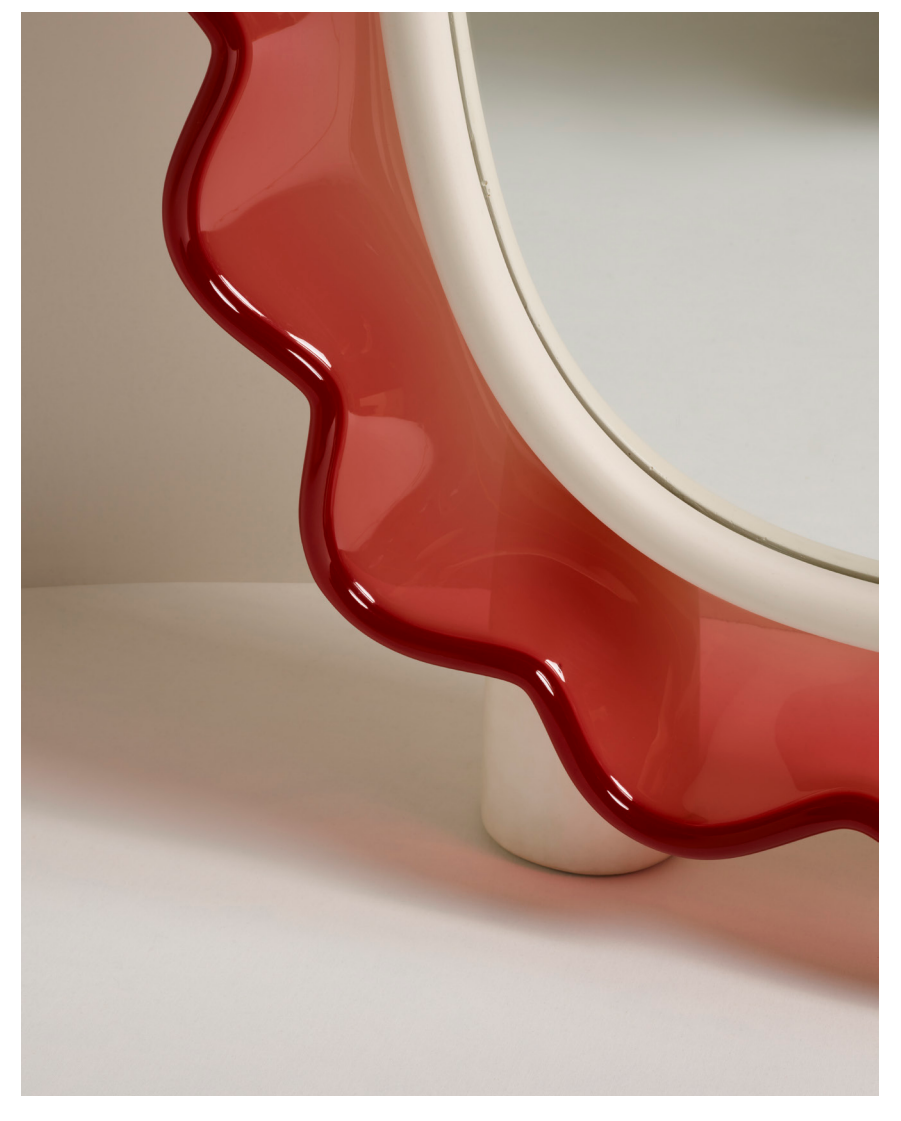
JELLYFISH EDITION OF 10