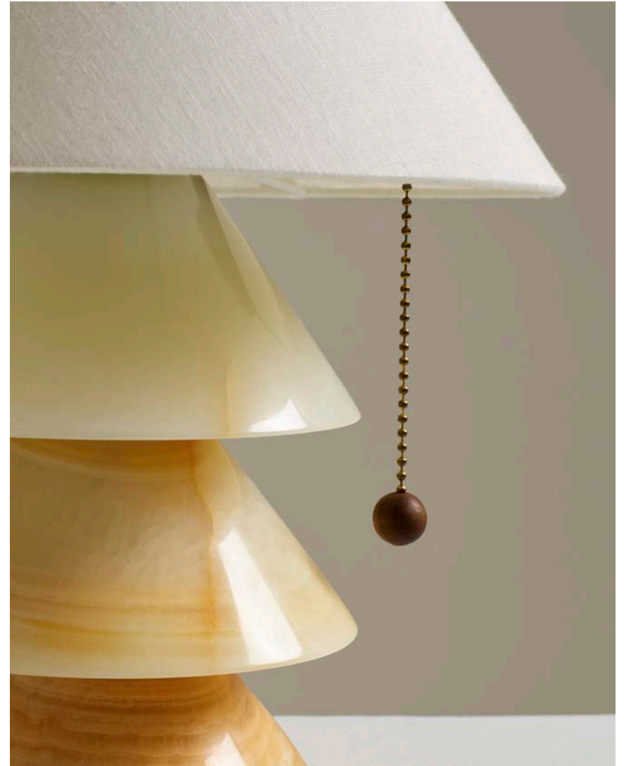
JUNIPER EDITION OF 30