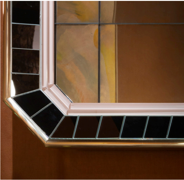
MIRROR & ANTIQUED MIRROR