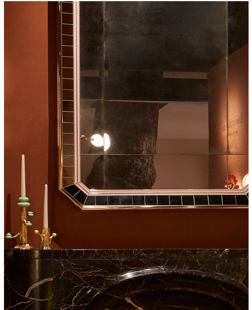
NO.76 EDITION OF 1