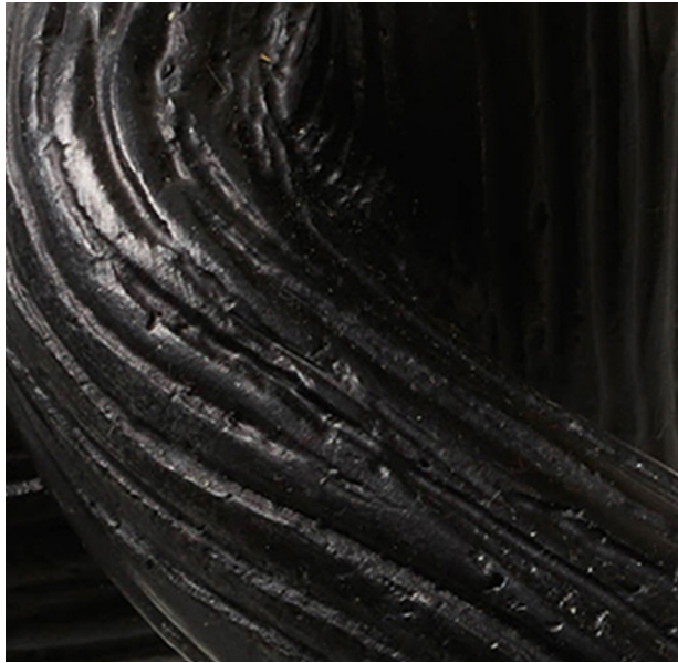
BLACKENED CAST BRONZE