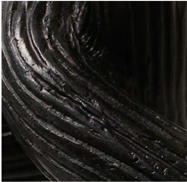
BLACKENED CAST BRONZE