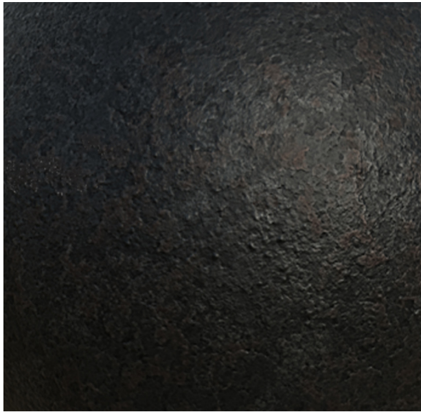
HAND FORGED STEEL